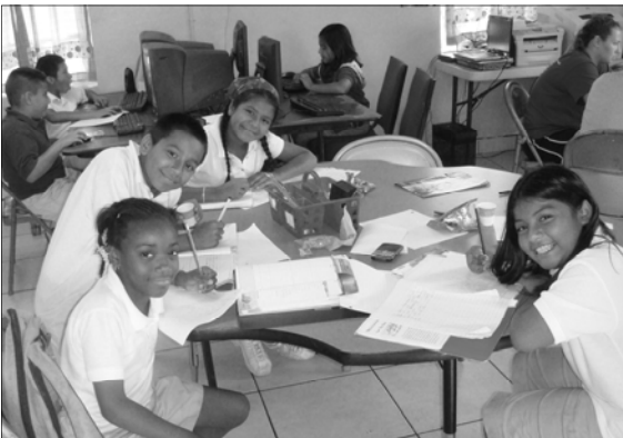
Branches students doing homework and research afterschool

Do you have an iPad or a computer? Well, we need your help! At Branches, we are challenging our students to open their minds to new ideas, this also includes technology. Even though the technology at our sites is basic, it is more than our students have access to at home or even at school.