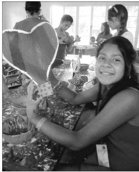
Students hard at work, creating beautiful art.