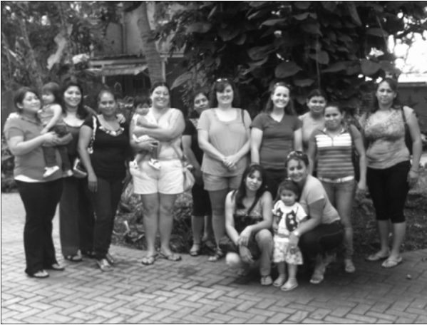
A group photo at Cauley Square!