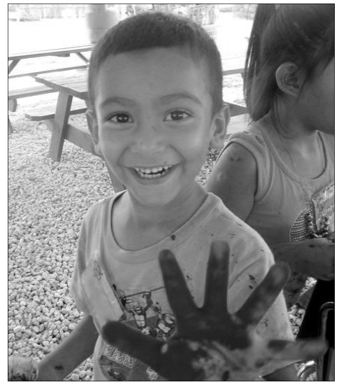
Celebrating India's Festival of Colors...by covering yourself in colorful powder!