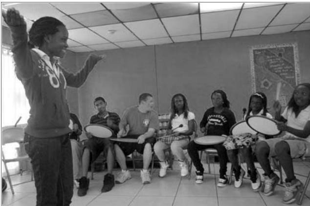
Enjoying Group Drumming together!