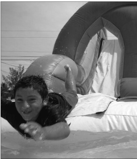
An awesome belly flop caught on camera!

One special activity which took place this summer was Group Drumming, organized by PlayTime Drums. 40 students from South Miami and Florida City took part in this four week long drumming workshop. The workshop is designed to teach students social skills such as leadership, communication, teamwork, and self-expression through the use of different percussion instruments. The students loved the program because it gave them a time to feel creative and empowered, not to mention the fact that they got to bang on drums for hours!