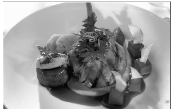
Enjoy award winning cuisine aboard the most elegant and romantic cruise line at sea, Celebrity Cruises!