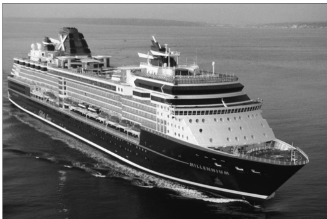
The gorgeous Celebrity Millennium in open waters...

Note: Guests must be 21 years of age or over. RSVP Deadline is October 3rd!