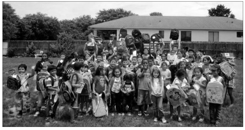
Back to School! Our elementary students are all smiles with their new backpacks and supplies.